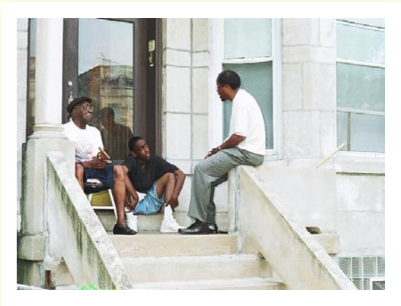
We envision a community that nurtures its young people and seeks wisdom from its elders.

We envision an Englewood where every resident, business owner, community and institutional leader is “making a difference.” The Englewood of 2010 will be a welcoming place where people from diverse economic backgrounds live, play and work together. It will be a community that nurtures its young people, seeks wisdom from its elders and provides an opportunity for lifelong learning and positive civic engagement.