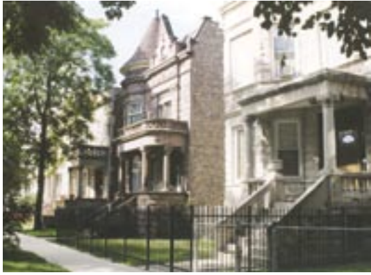
Pride in ownership is reflected in well-maintained greystone and brownstone residences along Central Park Avenue.

By 2010, North Lawndale will have a growing and diverse population with a mix of incomes, generations and cultures. It will be a place where people choose to live, invest, raise their families and work.