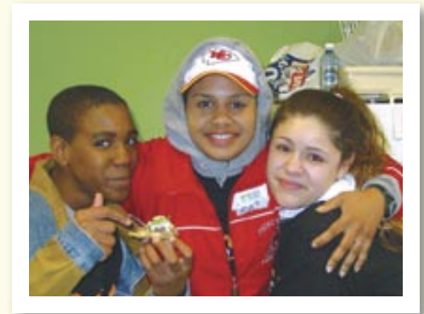
Creating positive environments for youth is a key strategy of this plan.