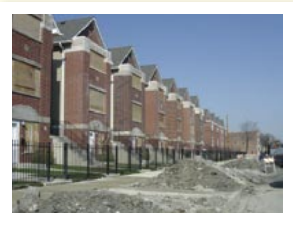
United Power's Ezra Homes development fills a once-vacant block in North Lawndale.

More than 30 years of hard work are showing results in North Lawndale in the form of new housing, public investment and renewed community life. Our neighborhood is on the upswing after decades of industrial job loss, disinvestment and population decline, and we are planning for its future.