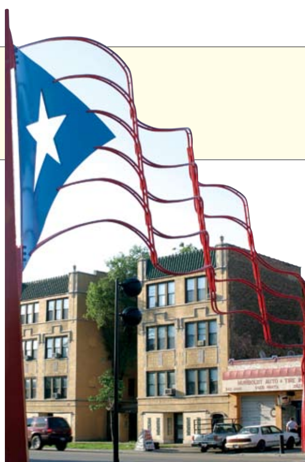
Puerto Rican flags serve as a gateway to the Paseo Boricua retail corridor on Division.

Further west across Kedzie Avenue, the problem is not so much gentrification as old-fashioned blight and decay. Here NCP partners including Nobel Neighbors and the West Humboldt Park