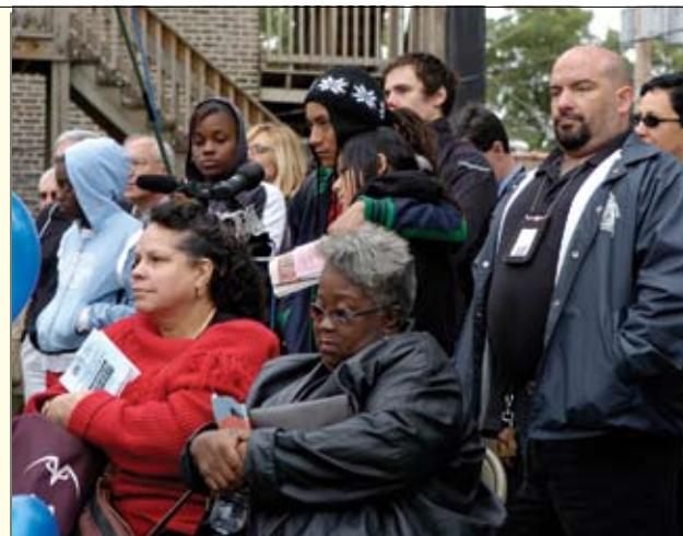
A diverse Humboldt Park crowd turned out for the La Estancia groundbreaking.

Sources: U.S. Census data from www.chicagoareahousing.org and Local Community Fact Book Chicago Metropolitan Area, 1984 and 1995.