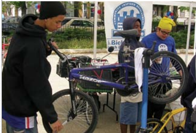
An early action project helped neighborhood kids learn how to fix bicycles and ride them safely.

Contact: Dena Al-Khatib, BRC, 773-278-5669; www.bickerdike.org , dal-khatib@bickerdike.org