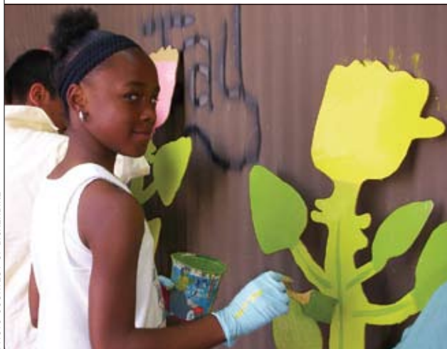
Students painted ornamental flowers and planted real ones at Casal School's garden project.

In October, Bickerdike and partners broke ground on La Estancia, a $21 million, 57-apartment residential-over-retail development on three sites along Division Street's Paseo Boricua business district. In West Humboldt Park, the city's first community-based land trust is identifying vacant lots for purchase—while the price is still right—for affordable housing. Lowell Elementary is adopting a “community school” format and an anti-violence Peace Games curriculum. A “Community of Wellness” has been formed to